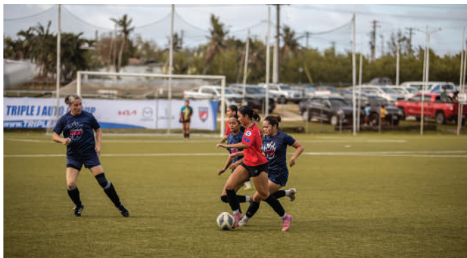
Athletes in action during a game for the 2025–2026 Bud Light Women's G-League regular season.